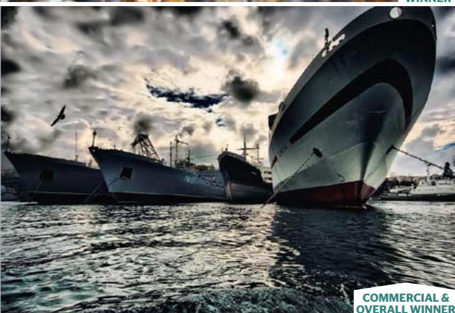
COMMERCIAL & OVERALL WINNER